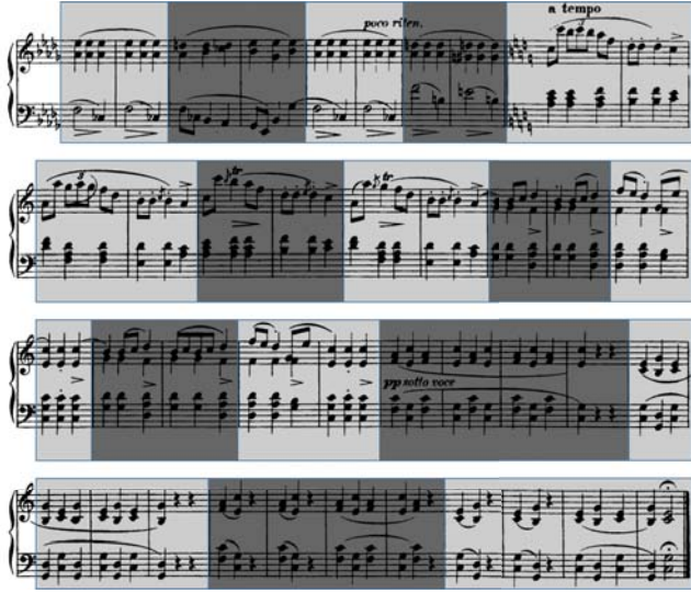
Fig. 2: Music structure analysis for phrasing of Chopin Mazurka Op.24 No.2.

Moreover, at certain positions, the performers agree on the change of tempo whereas for other positions the micro-structure of each arc differs from performer to performer. The agreed positions are usual the boundary of music structure.