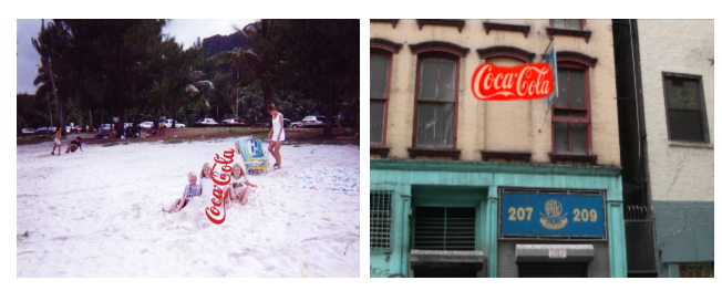
Figure 2. Comparing the visual effect of our logo exemplar with transparent background ( left ) and that of [10] with non-transparent background ( right ) in the synthetic logo images. Evidently our logo exemplar allows more diverse context than [10], which imposes a surrounding appearance in the synthetic image. More natural appearance is provided by our synthetic image.