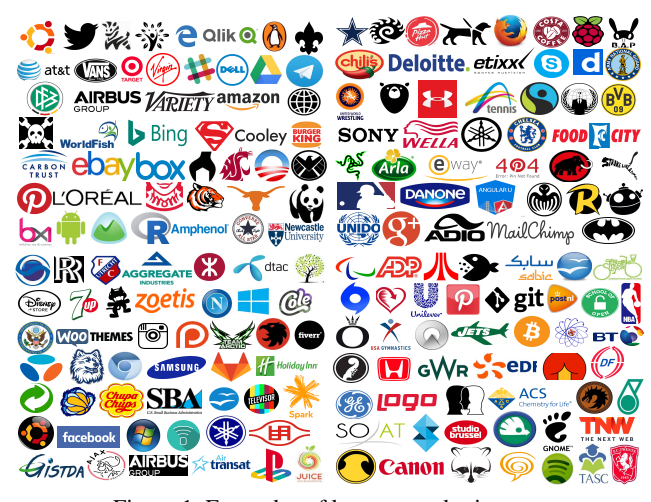
Figure 1. Examples of logo exemplar images.

Logo detection is a challenging task for computer vision, with a wide range of applications in many domains, such as brand logo recognition for commercial research, brand trend research on Internet social community, vehicle logo recognition for intelligent transportation [33, 31, 32, 5, 23, 28]. For generic object detection, deep learning has been a great success [30, 29, 35]. Building a deep object detection model typically requires a large number of labelled training data collected from extensive manual labelling [22, 36]. However, this is not necessarily available in many cases such as logo detection where the publicly available datasets are very small (Table 1). Small training data size is inherently inadequate for learning deep models with millions of parameters. Increasing manual annotation