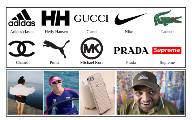
Figure 6. Exemplar images of top 10 logos ( Top ) and test image examples ( Bottom ) from our TopLogo-10 dataset.

non-logo context images. This randomness in logo placement provides a large variety of plausible visual scene context to enrich the synthesised logo training images. For every logo class, we generate 100 synthetic logo images in context through randomly selecting context images and applying geometric plus colouring transforms, resulting in 46,300 synthetic context logo training images. Examples of synthetic context logo images are shown in Figure 4.