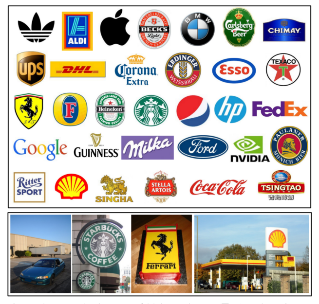
Figure 5. Exemplar images of 32 logo classes ( Top ) and test image examples ( Bottom ) from the FlickrLogo-32 dataset [33].

Given the logo exemplar image transforms described above, we generate a number of variations for each logo, and utilise them to synthesis logo images in context by overlaying a transformed logo exemplar at a random location in