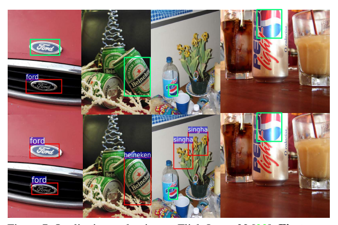
Figure 7. Qualitative evaluation on FlickrLogo-32 [33]. First row : detection results by "RealImg"; Second row : detection results by "SynImg-463Cls + RealImg". Logo detections are indicated with red boxes. Ground truth is indicated by green boxes.

For evaluating the effectiveness of our synthetic context logo images for learning a deep logo detector, we utilised the Faster R-CNN [30] as our logo detector. Other object detectors [29, 25] are also available but this is independent from our proposed method. We trained a Faster R-CNN detector by the following different processes and comparatively evaluated their logo detection performances. (1) RealImg: Only labelled real training image are used for model training. (2) SynImg-xCls: The synthetic labelled training data from x (x = 32 for FlickrLogo-32 and x = 10 for TopLogo-10) target logo classes are used for model training; (3) SynImg-463Cls: The synthetic labelled training data from all 463 logo classes are used for model training; (4) SynImg-xCls+RealImg: We first utilise the synthetic training data from the target logo classes to pre-train a Faster R-CNN, then fine-tune the model using labelled real training data; this is a staged curriculum learning model training scheme [4]; (5) SynImg-463Cls+RealImg: Similar to SynImg-xCls+RealImg but with a difference that all synthetic training data are used for pre-training the detector; (6) SynImg-463Cls+RealImg (Fusion): Similar to SynImg-463Cls+RealImg but with a difference that the model is trained in a single step using the fusion of synthetic and