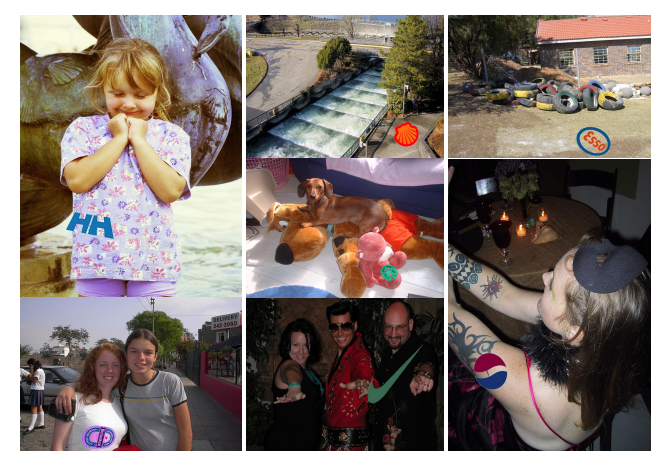
Figure 4. Examples of generated synthetic context images. Given non-logo images from the FlickrLogo-32 dataset [33] as context images, these synthetic training images are fully annotated automatically without any logo instances unlabelled/missing.

(I) Geometric Transform. Suppose a logo image I is on a 3D plane, a general geometric transform of the image is computed as: