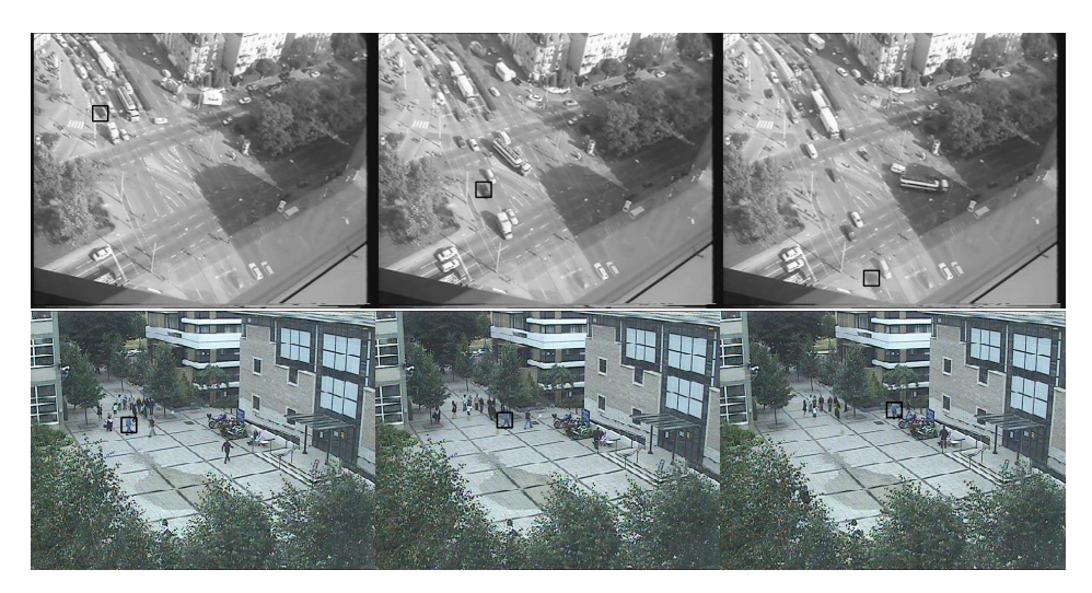
Figure 6: A car on a busy road is tracked in Experiment 11 and a pedestrian is tracked in Experiment 12. It is shown that the tracker combined with non-uniform sampling for arbitrary spatial weighting tracks the car and the pedestrian successfully.

weights is triggered by the white frame of the glass door. To evaluate our method using non-uniform sampling for arbitrary spatial weighting, a car on a busy road is tracked in Experiment 11 and a pedestrian is tracked in Experiment 12 (Figure 6). It is shown that the tracker combined with non-uniform sampling for arbitrary spatial weighting tracks the car and the pedestrian successfully. The spatial distributions of the pixels from the car and the pedestrian (Figure 7) extracted by Normalized Cut are used to build two-dimensional histograms for the estimate of the spatial importance, \hat{o}(\mathbf{x}) . The number of bins used is 9 for the two-dimensional histograms in both of the experiments. Furthermore, Experiment 9 is repeated without on-line feature selection. Figure 3 shows that the original mean-