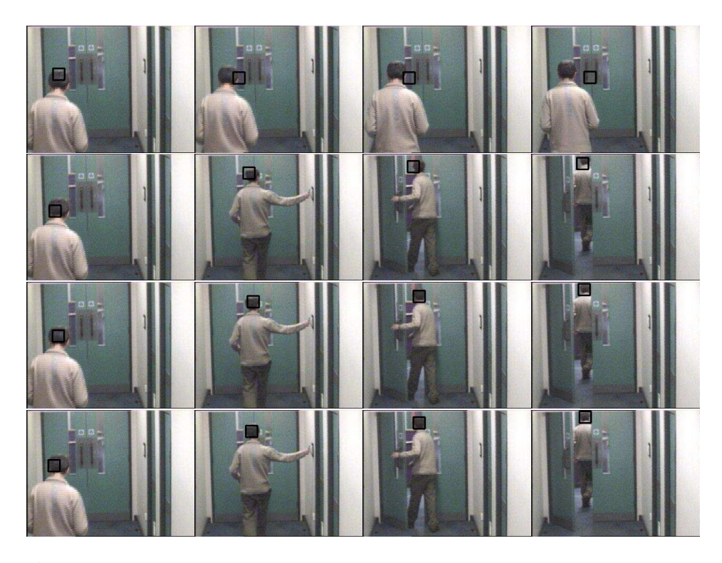
Figure 2: Experiments 5, 6, 7 and 8: The four rows of images represent four separate video sequences produced by four experiments respectively. In Experiment 5 (first row), only 2 random samples are picked from each of the candidate and model images, 3 samples in Experiment 6 (second row), 5 samples in Experiment 7 (third row) and all samples from the candidate and model images (traditional Mean-Shift Tracking) in Experiment 8 (fourth row).

Our first four experiments, as shown in Figure 1, evaluate the number of random samples required to track a typical object which is a human face in the experiments. In the first experiment, only 5 random samples are picked from each of the candidate and model images, 10 samples in the second experiment, 15 samples in the third and all samples from the candidate and model images (traditional Mean-Shift Tracking) in the fourth. Tracking fails with too few samples. The tracker fails with 5 samples from the image of the object. With 10 samples, as shown in the second row of Figure 1, the tracker tracks the object successfully but the trajectory is not very stable when compared with the tracker with 150 samples (fourth row). There is no difference between the tracking performance of the mean-shift tracker with 15 samples (third row) and that of the tracker with 150 samples. A larger number of samples more than 15 does not make any difference to the tracking performance of the tracker. On Matlab, the time required for the tracking in Experiments 1, 2, 3 and 4 are 2.95 fps (frames per second), 2.63 fps, 2.18 fps and 0.04 fps respectively. Experiments 5, 6, 7 and 8, as shown in Figure 2, evaluate the number of random samples required to track an object with a relatively simple distribution which is the head of a person. In Experiment 5, only 2 random samples are picked from each of the candidate and model images, 3 samples in Experiment 6, 15 samples in Experiment 7