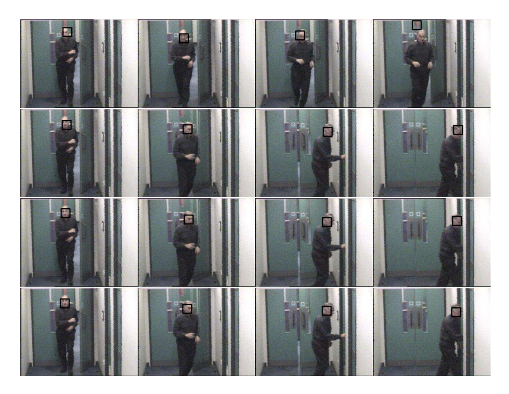
Figure 1: Experiments 1, 2, 3 and 4: The four rows of images represent four separate video sequences produced by four experiments respectively. In the first experiment (first row), only 5 random samples are picked from each of the candidate and model images, 10 samples in the second experiment (second row), 15 samples in the third (third row) and 150 samples in the fourth (fourth row).

In this section, we propose to boost the efficiency of mean-shift tracking using random sampling and evaluate the efficiency of the proposed method. When the computational efficiency for mean-shift tracking with random sampling was evaluated, we obtained the surprising result that mean-shift tracking requires only very few samples. We show that robust tracking can be achieved with as few as even 5 random samples from the image of the object. With random sampling, the computational complexity of Mean-Shift Tracking is independent of object size. Near real-time performance is obtained even in our Matlab implementation because, instead of passing hundreds of samples to a traditional mean-shift tracker, only 5 random samples are required for the mean-shift tracker to track objects with a relatively simple distribution and 15 samples for a typical distribution. The speed of our tracker is 2.17 fps (frames per second) to track the head of a person in a given video sequence while the speed of a traditional implementation used in [7] is 0.011 fps (197 times slower) with the same tracking sub-window size of 24x25 (600 samples without random sampling).