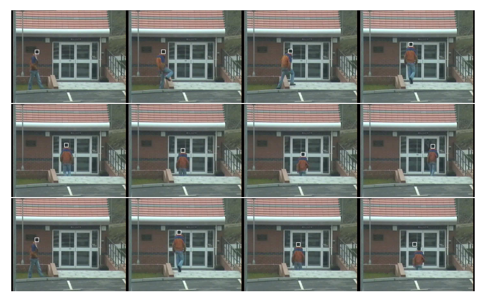
Figure 3: In Experiment 9 (first two rows), the black hat of a person against a red wall and a glass door as the background is tracked. It is shown that the tracker combined with our on-line feature selection method tracks the black hat successfully when the hat moves in front of a glass door outside a dark corridor. In the bottom row, Experiment 9 is repeated without on-line feature selection. The original mean-shift tracker is distracted by the glass door on the background.