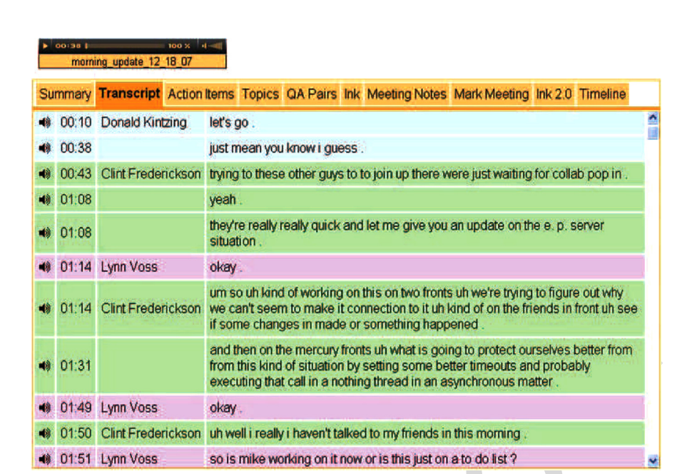
Fig. 3. Snapshot from the CALO-MA offline meeting browser.

During a meeting, client software sends Voice over Internet Protocol (VoIP) compressed audio data to the server either when energy thresholds are met or when a hold-to-talk mechanism is enabled. The data transport server splits the audio: sending one stream to meeting data processing agents for preprocessing and processing the data. Any processing agents that operate in real-time send their data back to the data transport server that relays the data back to the meeting participants.