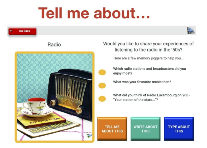
Fig. 1 Screenshot of Tablet application once topic is chosen (here "Radio")

care homes. The 50s and 60s material was adapted for use in the tablet application. The 70s material was created for the purpose of the study. The collected corpus covers a set of 67 images/topics. Phase 1 includes 26 topics from the 50s and Phase 2 includes 41 images from the 60s and 70s. By design topics were meant to be repeated every so often but based on individual's feedback such repetition has been minimised and each phase includes different material. In particular, Phase 1 topics include: Goblin Teasmade, Washday and Smog, Keeping Warm, Household smells, Sundays, Housewives, Budgies, Radio, Television, The cinema and music, The Goons, Weekly children's comics, The Coronation, Holiday Camps, The Modern Era - transport, Endless freedom, Toys and books, School, Knitting, Hair, Teddy boys and teenagers, Bikes, Fashion, Immigration, National Service, Sport. Phase 2 was augmented with more images from the 70s, which seems to better fit the memory bump of our participant cohort.