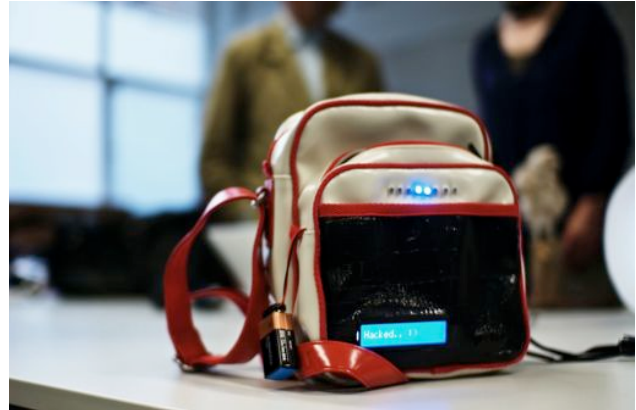
Figure 2. Early prototype of message bag .

an audio cue tells them that an item (tag) has been scanned and registered by the reader and it is just a simple beep. This could be enhanced in a way to give the user and perhaps users who are visually impaired a clearer idea of what is missing. Another change that could be implemented in the next prototype would be the use of RFID as well as near field communication (NFC) which could have the added benefit of being integrated with the users mobile phone for example or a more complex reading / writing system for the users objects.