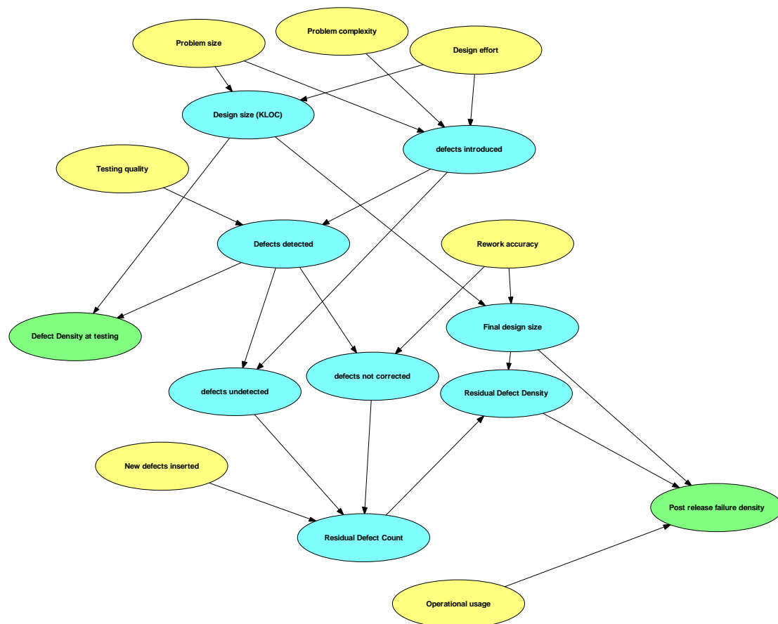
Figure 2: A BBN that models the software defects insertion and detection process

A BBN is a graphical network (such as that shown in Figure 2) together with an associated set of probability tables. The nodes represent uncertain variables and the arcs represent the causal/relevance relationships between the variables. The probability tables for each node provide the probabilities of each state of the variable for that node. For nodes without parents these are just the marginal probabilities while for nodes with parents these are conditional probabilities for each combination of parent state values. The BBN in Figure 2 is a simplified version of the one that was built in collaboration with the partner in the case study described in Section 4.