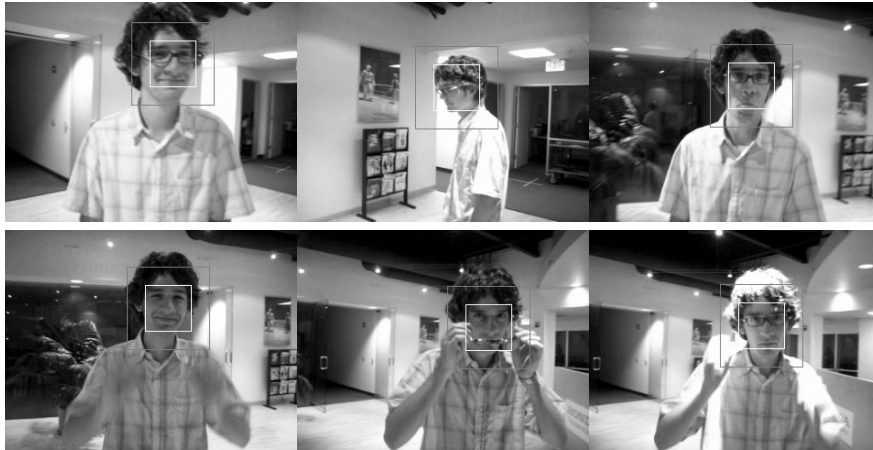
Fig. 1 Examples of face tracking using the online boosting algorithm [44].

Visual tracking of objects has been intensively studied in computer vision, and different approaches have been introduced, for example, particle filtering [13] and mean shift [19, 23]. Accurate face tracking is difficult because of face appearance variations caused by the non-rigid structure, 3D motion, occlusions, and environmental changes (e.g., illumination). Therefore, adaptation to changing target appearance and scene conditions is a critical property a face tracker should satisfy. Ross et al. [88] represented the target in a low-dimensional subspace which is adaptively updated using the images tracked in the previous frames. In [44], Grabner et al. introduced the online boosting for tracking, which allows online updating of the discriminative features of the target object. Some face tracking results of their approach are shown in Fig. 1. Compared to the approaches using a fixed target model such as [14], these adaptive trackers are more robust to face appearance changes in video sequences.