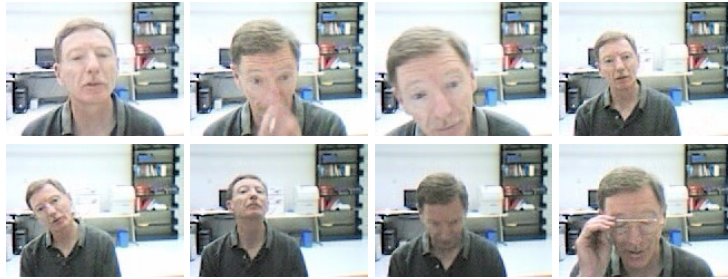
Fig. 4 Example frames from video sequences in the IIT-NRC database.

recognition rate of over 95% on the IIT-NRC database 1 of 11 subjects. Some example frames of this database are shown in Fig. 4.