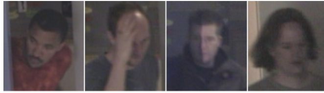
Fig. 2 The real-world video data used in [98], which shows a variety of different lighting, pose and occlusion conditions.

reliable matching requires the best match to be significantly better than the second-best match, DT2ND is used to reduce the impact of frames which deliver ambiguous classification results. Their experiments on a database of 41 subjects show both measures have positive effects on the classification results. Despite promising results, the need for parameter tuning and heuristic integration schemes may limit the generalization of this approach.