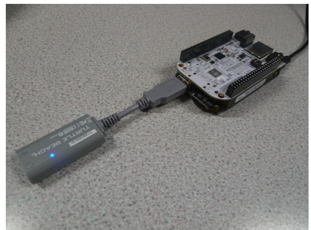
Figure 1: The USB interface and the Audio Cape attached to the BeagleBone Black.

Although belonging to a new generation of compact and fully accessorised boards (e.g., HDMI, uSD card slot), the BBB does not natively provide any audio interfacing. To test the performances of this board in relation to high quality audio synthesis, two commercially available audio interfaces were chosen for comparison; these were both configured for use with the board so as to provide real-time audio output.