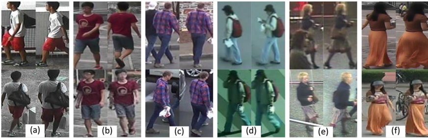
Fig. 4. Example cross-view matched image/tracker pairs from (a) CUHK03, (b) Market-1501, (c) DukeMTMC, (d) PRID2011, (e) iLIDS-VID, (f) MARS.

Datasets. To evaluate the proposed TAUDL model, we tested both video (MARS [59], iLIDS-Video [50], PRID2011 [19]) and image (CUHK03 [29], Market-1501 [60], DukeMTMC [41,61]) based person re-id benchmarking datasets. In previous studies, these datasets were mostly evaluated separately. We consider since recent large sized image based re-id datasets were typically constructed by sampling person bounding boxes from video, these image datasets share similar characteristics of those video based datasets. We adopted the standard person re-id setting on training/test ID split and the test protocols (Table 1).