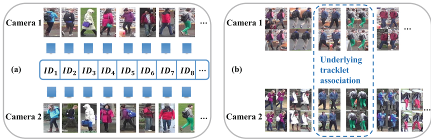
Fig. 3. Comparing (a) Fine-grained explicit instance-level cross-view ID labelled image pairs for supervised person re-id model learning and (b) Coarse-grained latent group-level cross-view tracklet (a multi-shot group) label correlation for ID label-free (unsupervised) person re-id learning using TAUDL.

Given per-camera independently-labelled tracklets \{S_i, y_i\} generated by SSTT, we perform tracklet label re-id discriminative learning without person ID labels in a conventional classification deep learning framework. To that end, we formulate a Tracklet Association Unsupervised Deep Learning (TAUDL) model. The overall design of our TAUDL architecture is shown in Fig. 1. The TAUDL contains two model components: (I) Per-Camera Tracklet Discrimination Learning with the aim to optimise “local” (within-camera) tracklet label discrimination for facilitating cross-camera tracklet association given independently created tracklet label spaces in different camera views. (II) Cross-Camera Tracklet Association Learning with the aim to maximise “global” (cross-camera) tracklet label association. The two components integrate as a whole in a single deep learning network architecture, learn jointly and mutually benefit each other in an incremental end-to-end manner.